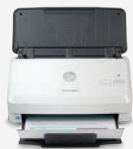
HP recommended scanner: HP ScanJet Pro 2000 s2

"I accumulate so many things that I need to scan. Since I am trying to get rid of paper, a scanner helps me keep things organized."