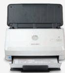
HP recommended scanner: HP ScanJet Pro 3000 s4

"Having a scanner at my desk is vital. Before I got my scanner, I had to email myself the documents, save, and upload. It was a hassle."