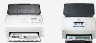
HP recommended scanner: HP ScanJet Enterprise Flow 7000 s3 and N7000 snw1

"Having a scanner makes it easier to find things in the electronic document system."