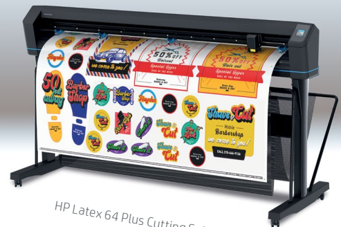
HP Latex 64 Plus Cutting Solution