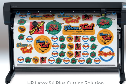
HP Latex 54 Plus Cutting Solution