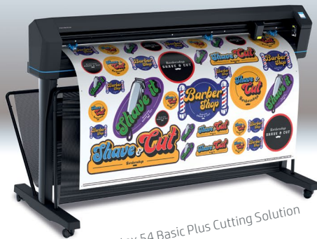
HP Latex 54 Basic Plus Cutting Solution

Grow your business by enhancing your HP Latex printer with our unique print AND cut workflow 1