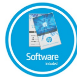
HP FlexiPRINT and CUT RIP