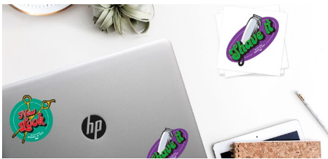
LABELS AND STICKERS