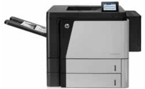
HP LaserJet Enterprise M806dn Printer

Mobile printing capability: HP ePrint, Wireless direct printing (only in M806x+ NFC/Wireless Direct), Apple AirPrint™, Mobile Apps