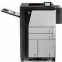
HP LaserJet Enterprise M806x+ NFC/Wireless Direct Printer