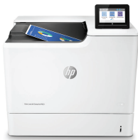
HP Color LaserJet Enterprise M653dn