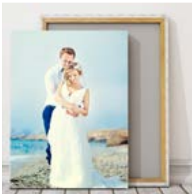
Photo canvas printing expands product offering.