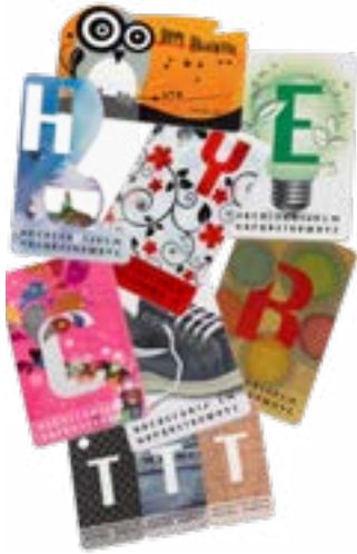
Print plastic cards using One Shot Color printing.

Field upgradability. Most of the innovations in the press are upgradable options for HP Indigo 7000 Series digital presses.