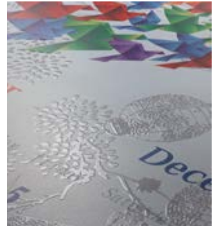
Raised print produces eye-catching, tactile effects.

Finishing automation. HP Indigo's Direct2Finish near-line or inline capability offers the capability to move jobs from print to finish flawlessly, transmitting JDF instructions from the print server to the JDF-enabled finisher automatically sets up and operates the finishing device, saving time, reducing errors and eliminating waste.