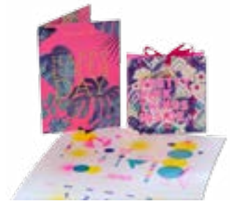
HP Indigo ElectroInk Fluorescent pink for high-value pages.

Use HP SmartStream products and partner solutions with the HP Indigo 7800 Digital Press to improve production efficiency and support digital growth. To learn more visit hp.com/go/smartstream