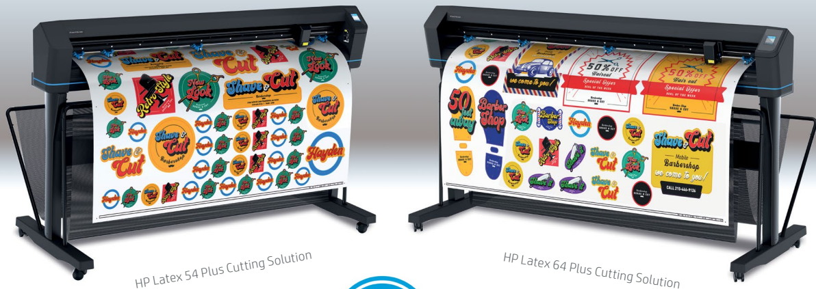
HP Latex 54 Plus Cutting Solution

Grow your business by enhancing your HP Latex printer with our unique print AND cut workflow 1