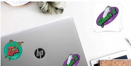
LABELS AND STICKERS