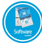
HP FlexiPRINT and CUT RIP