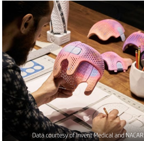
Data courtesy of Invent Medical and NACAR