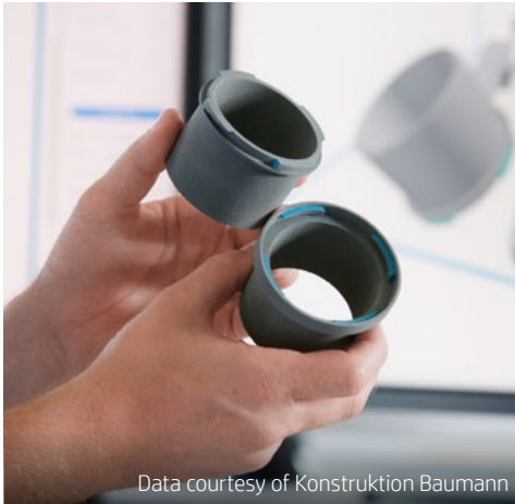
Data courtesy of Konstruktion Baumann