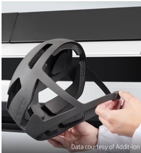
Data courtesy of Addit-ion