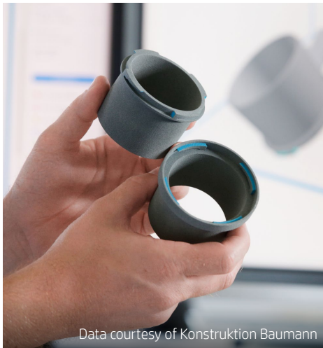
Data courtesy of Konstruktion Baumann

Gain new levels of cost predictability with the flexibility to scale your business as you grow