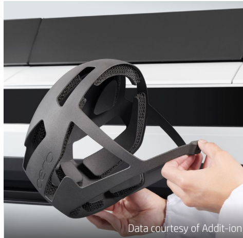
Data courtesy of Addit-ion