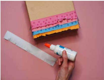
STEP 4 / Start gluing the paper stripes on one side of the box strating from the bottom