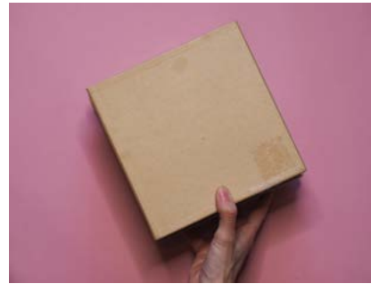
STEP 3 / You will need a cardboard box (any shape will do)