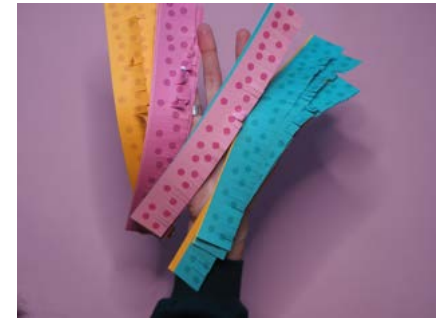
STEP 4 / Cut fringes on the paper stripes (remember to keep an untouched band wide enough to put glue on)