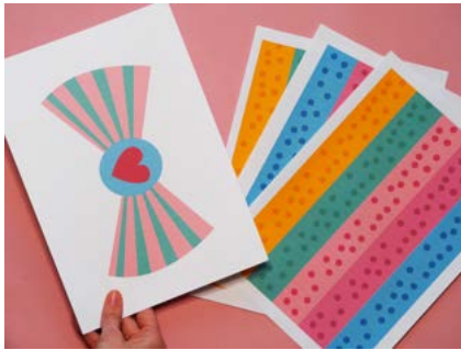
STEP 1 / Print the designs with your Hp printer