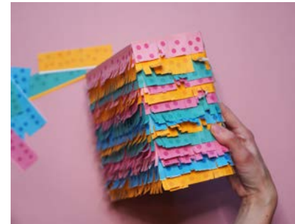
STEP 5 / Now you will have to do the same on every side of the box