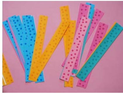
STEP 2 / Cut around the illustrations