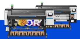
HP Latex 830/830 W