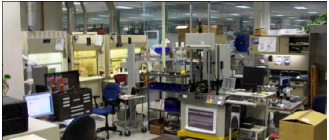
Figure 1. The HP Workstations Materials Science Lab, a state of the art facility used to test workstation products beyond standard industry practices.

Poor materials and processes used commonly in the industry will produce designs that are subject to premature failure. Our analysis, specifications, and selection processes drive designs using above-standard quality components. One example of this is memory sockets. Each socket comprises hundreds of contacts whose material interface, if not carefully selected, deposited and controlled, can lead to corrosion. A corroded contact can create a point of failure on a system motherboard in a data-sensitive area. The quality of the materials and the chemicals used in our memory sockets, such as the thickness and quality of the gold plating deposition process are carefully evaluated. If necessary, we work with the manufacturers to drive the parts to the proper quality levels.