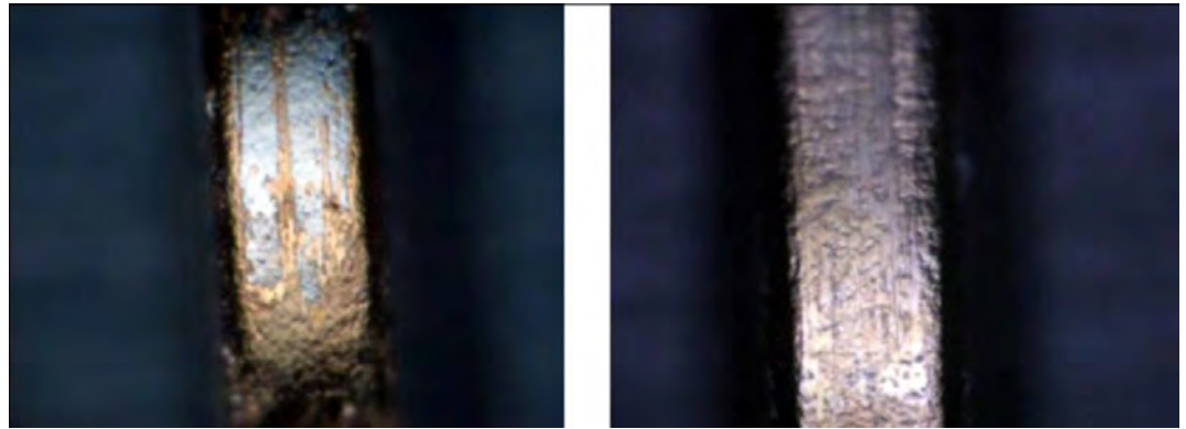
Figure 2. A failing (left) and passing (right) result from the standard socket wear testing procedure.

This same level of materials analysis was used during our conversion to BFR (brominated flame retardant) and PVC (polyvinyl chloride) free systems 1 . The Z by HP R&D team did not treat all available unrestricted materials as acceptable options. We engaged in a thorough analysis of the new materials that would need to be used on motherboards, in cases, and in connectors to ensure that the BFR/PVC free materials met our reliability and performance expectations. The result of this analysis was materials that exceeded our expectations in almost every category of mechanical and electrical reliability and performance, while producing a product with a reduced environmental impact. 2