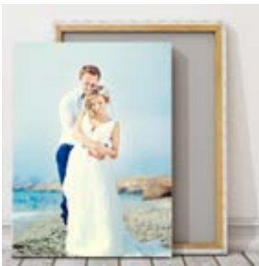
Photo canvas printing expands product offering.