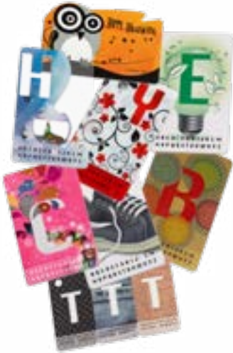
Print plastic cards using One Shot Colour printing.

Field upgradeability. Most of the innovations in the press are upgradable options for HP Indigo 7000 Series digital presses.