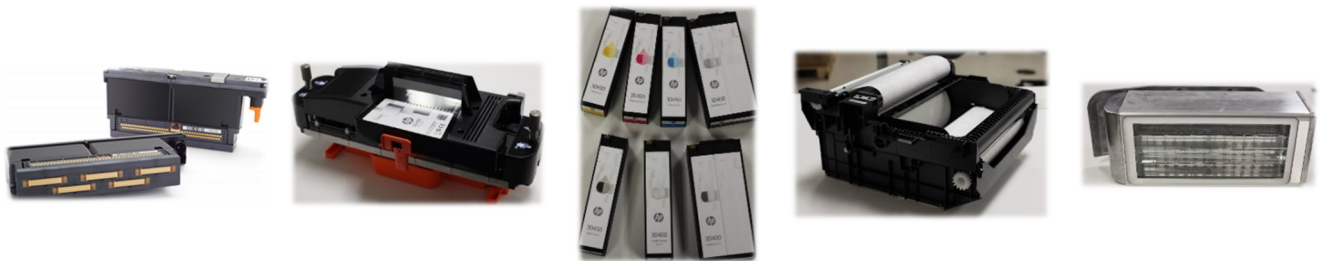
HP 3D600/710 Printheads

Please note - In following countries HP's Planet Partners Program may not be available for certain 3D products: EU, Israel, Morocco, Norway, Serbia, South Africa, Switzerland, Turkey, Argentina, Brazil, Colombia, Mexico, Peru, Hong Kong, India, Japan, New Zealand, Singapore, Thailand. For a list of SKUs see below.