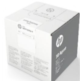
3L and 5L Agent Cartridges