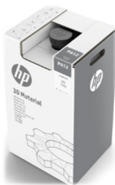
30L Materials Container

Select link below for recycling preparation instructions.